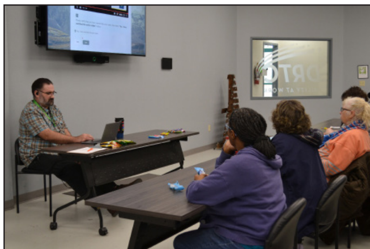
Clients at a meeting