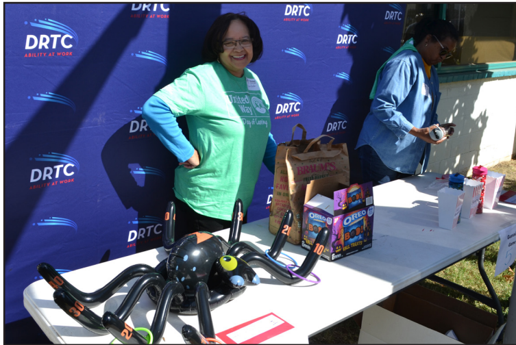
United Way Steering Committee