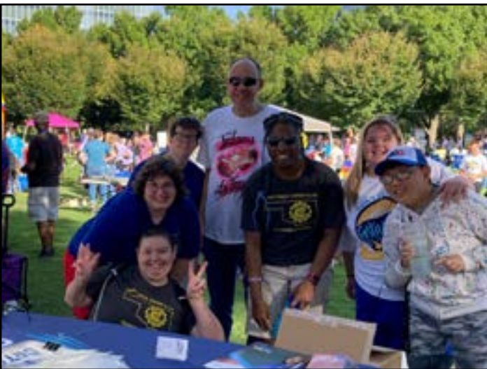
Happy Trails Civitan