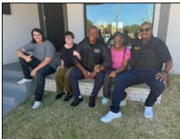
DRTC actors and IDD Safe