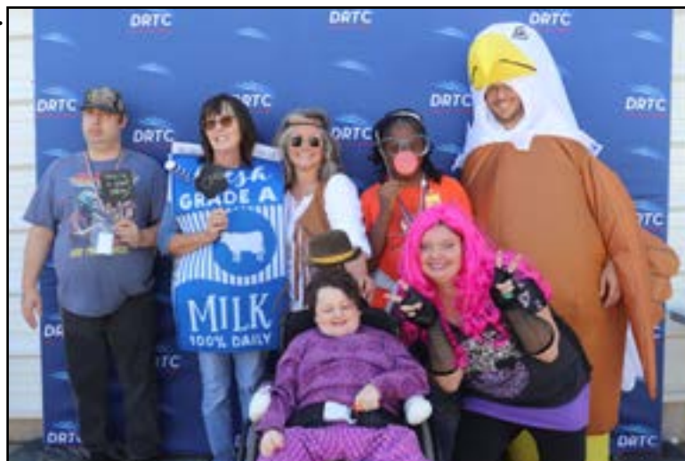
2022 Fall Festival

Our Fall Festival is coming up on October 25. There will be 3 food trucks to choose from for lunch beginning at 11:00. Individuals will be released in shifts to avoid long waits. You can choose from hamburgers and hot dogs, tacos or Philly cheesesteaks. We will also have a dessert truck to soothe that sweet tooth at 12:30. We will have games and a D.J. with plenty of room for dancing.