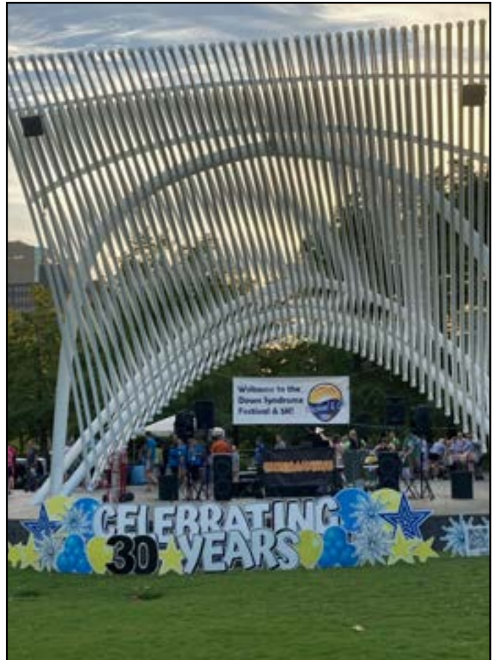
DSACO Festival Celebrating 30 Years