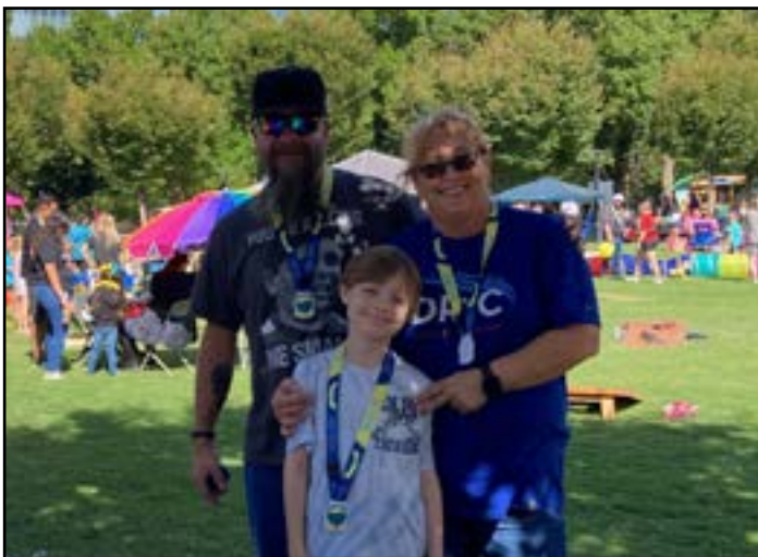
D'Oun and family